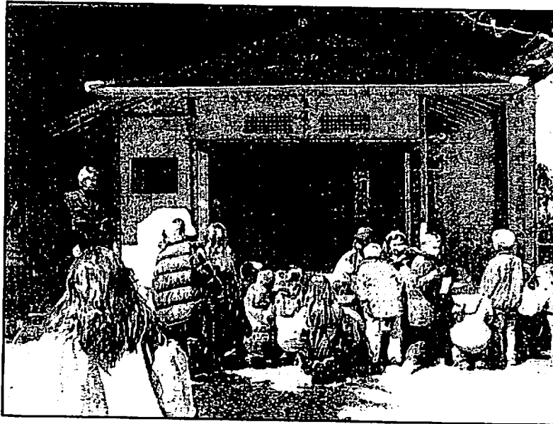
After the tea ceremony, the students gathered at the teahouse on the museum grounds.